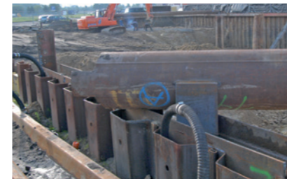
LP interlocking type