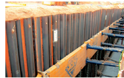
KD 6/8 sheet piles